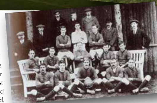
Wearing their village team kit with pride just like the Barford football team of 1911

further sponsorship from Plum Save Ltd of Leamington Spa and six other donations making the purchase possible and enabling the children to leave the borrowed shirts to one side and proudly pull on their own new kit.