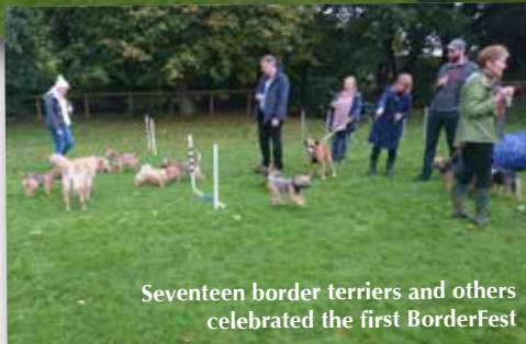
Seventeen border terriers and others celebrated the first BorderFest

in the village felt that the new facilities may leave little space for dogs within the park. One resident said: "I thought with all the additions for children that dogs wouldn't be welcome. Now we've got the best of both worlds, still space for the dogs to run but if it's muddy there's a tarmac path to use so I don't have to get my wellies on!"