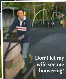
Don't let my wife see me hoovering!