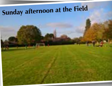
Sunday afternoon at the Field