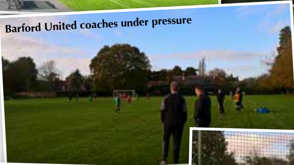
Barford United coaches under pressure