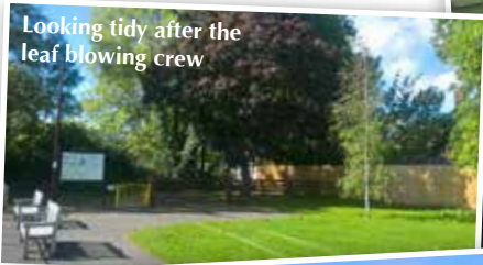
Looking tidy after the leaf blowing crew