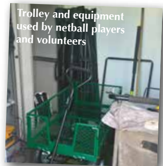
Trolley and equipment used by netball players and volunteers

We've even been able to use the trolley to move an injured player off the court as she needed to go