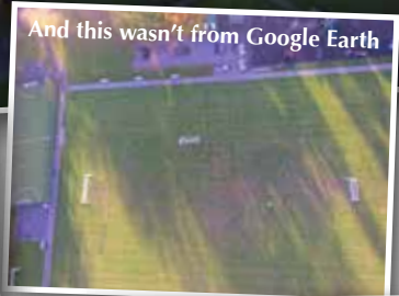
And this wasn't from Google Earth