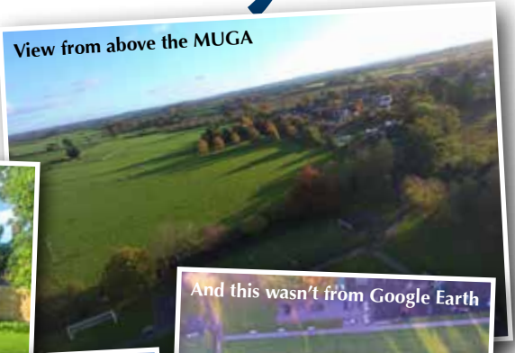
View from above the MUGA