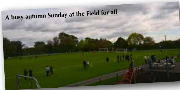
A busy autumn Sunday at the Field for all